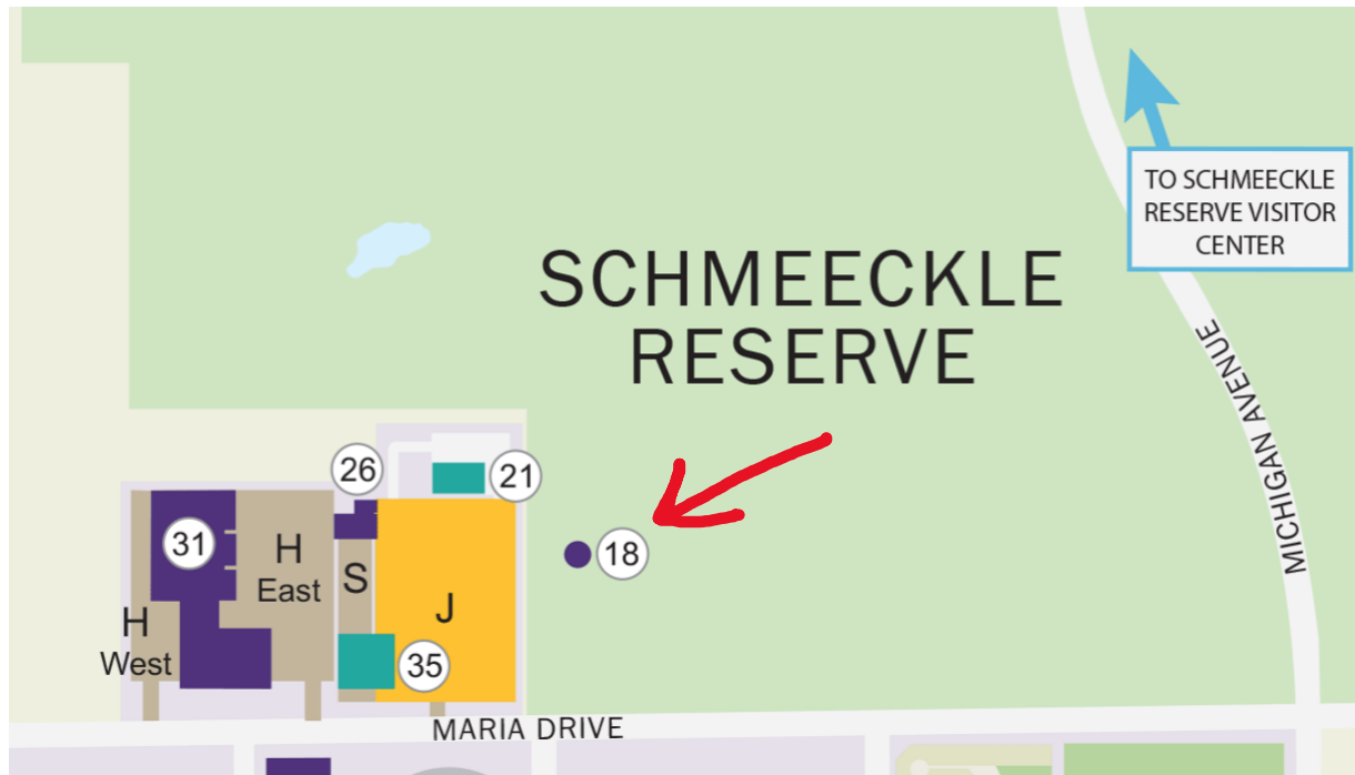
Figure 2. Map of Schmeckle showing the meeting location at Schmeckle pavilion, labeled number 18.